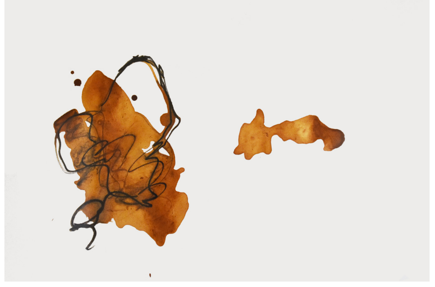
Luzene Hill, Untitled , 2012, tea and charcoal on paper, 11 × 14 inches. Collection of the Artist.